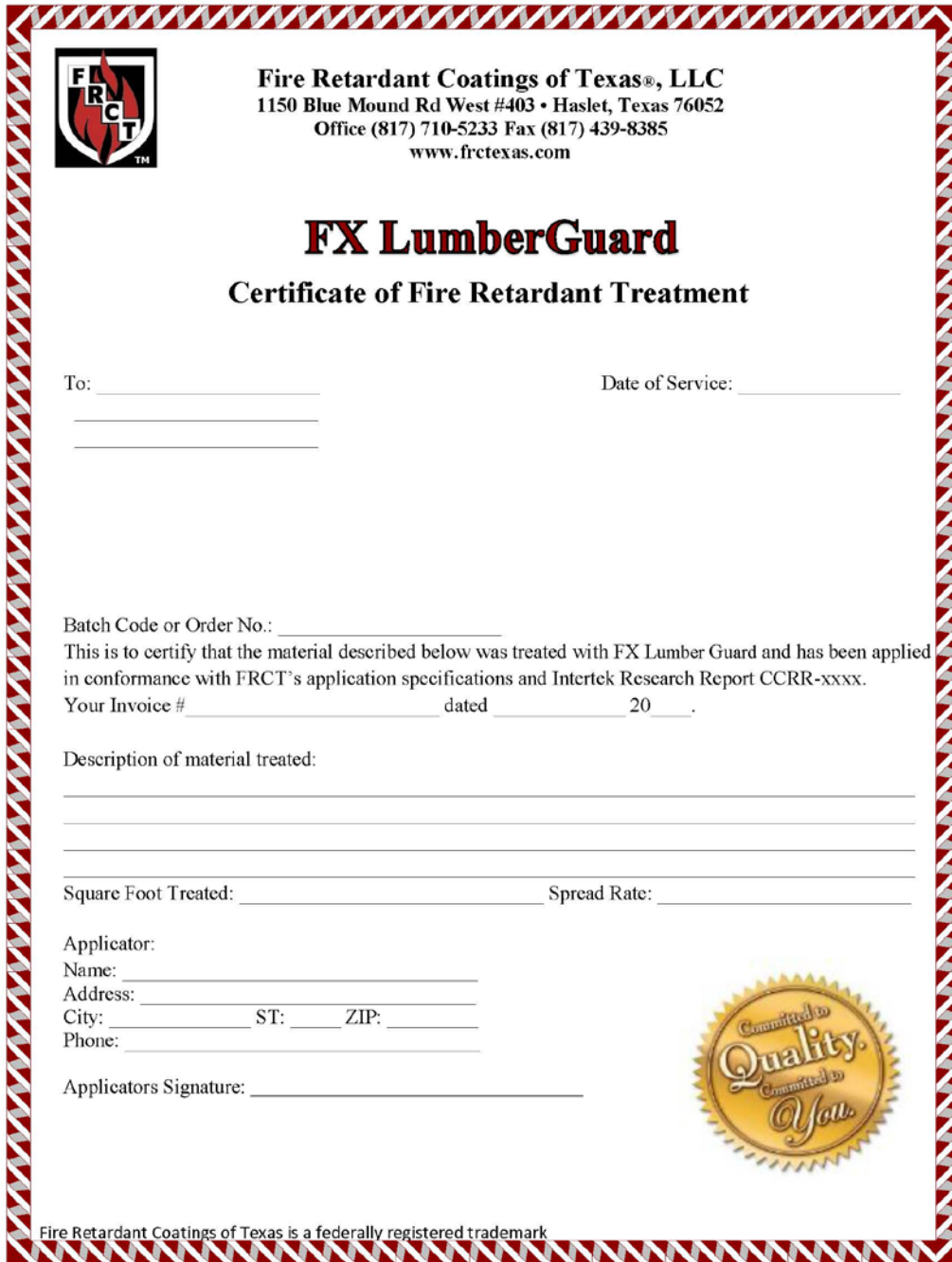
Figure 1 – Example of Certificate of Treatment (field application)