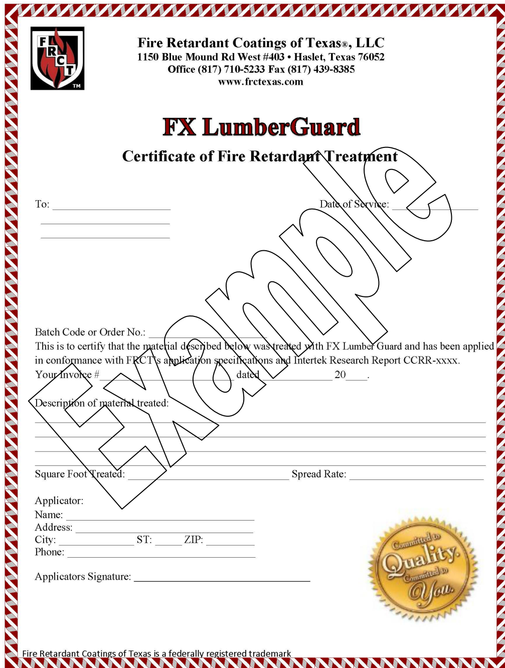
Figure 1 – Example of Certificate of Treatment (field application)