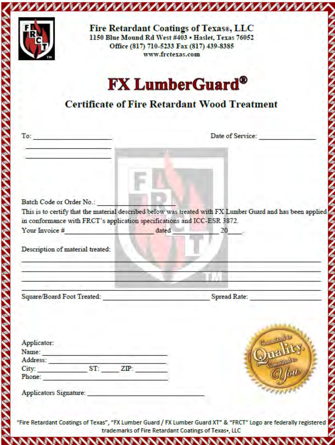
FIGURE 1—EXAMPLE OF CERTIFICATE OF TREATMENT (COT) FOR FX LUMBER GUARD